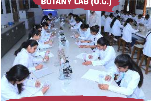
BOTANY LAB (U.G.)