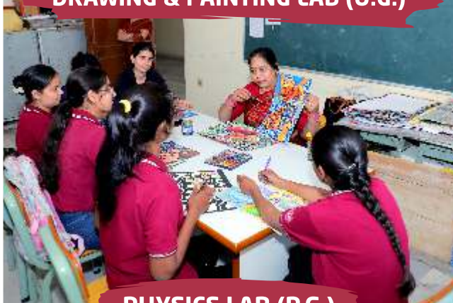
DRAWING & PAINTING LAB (U.G.)