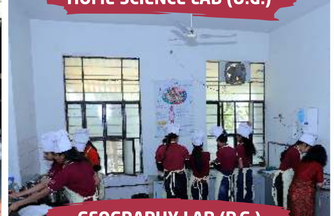
HOME SCIENCE LAB (U.G.)