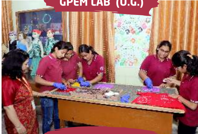
GPEN LAB (U.G.)