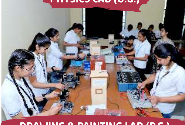
PHYSICS LAB (U.G.)