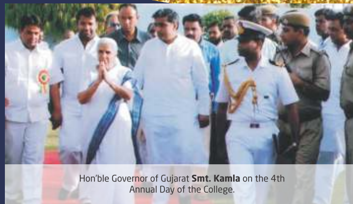
Hon'ble Governor of Gujarat Smt. Kamla on the 4th Annual Day of the College.