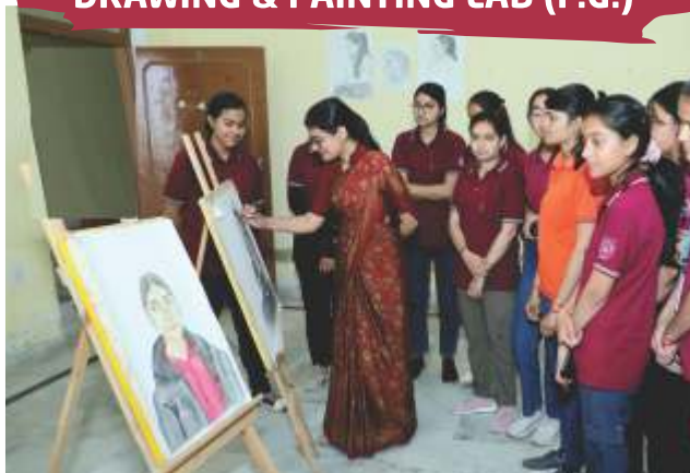
DRAWING & PAINTING LAB (P.G.)