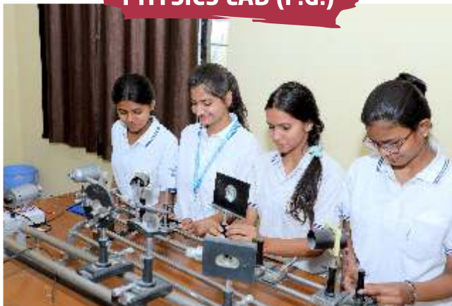
PHYSICS LAB (P.G.)